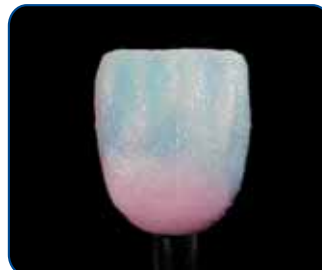
5. Additional translucent and enamel porcelains may be used for various effects.