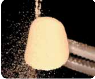
2. Depending on the shade apply the medium or dark crystals.