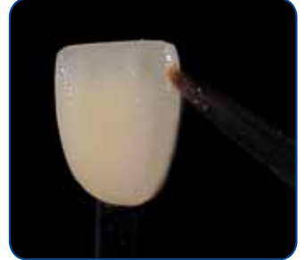
2. Apply the overglaze and stains. Fire the crown according to the recommended temperatures.