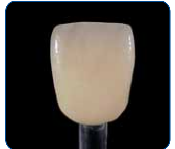
3. Completed basic crown.