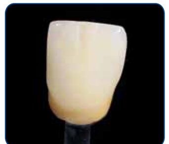
4. Completed crown with internal characterization.