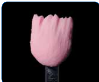
2. Apply the dentin porcelain allowing room for the enamel porcelain.