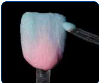
4. Apply the appropriate enamel porcelain.