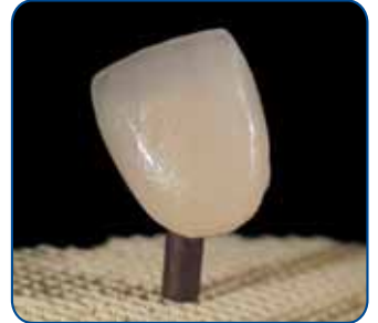
1. Fire according to the recommended temperatures.