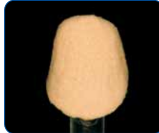
6. Fire according to the recommended temperatures.