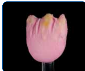
3. Mamelon porcelain may be placed on the lobes.