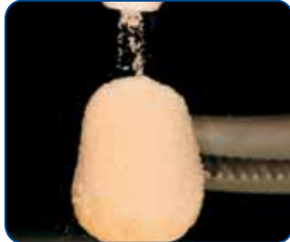
5. Apply the light crystals.