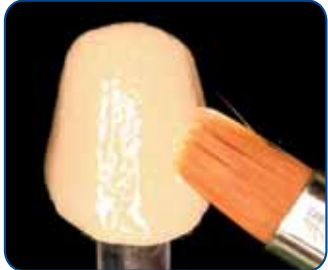
4. Apply the shaded paste.