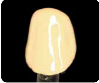
1. Apply base paste to mask out the metal.