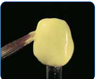
1. Opaceous dentins are the same shade as the dentins, but with 10% more opacity. Apply a thin layer to the opaqued surface.