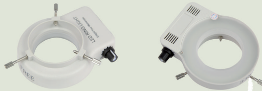
77 Diodes LED Ring Light