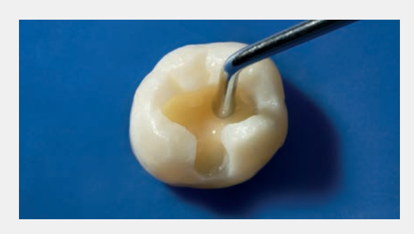
lonosit Baseliner is applied in a thin layer between dentin and composite.