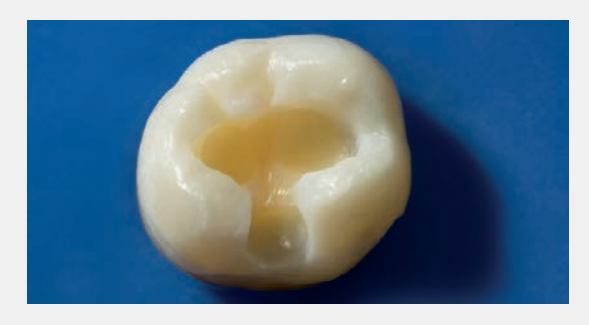
Class-II-cavity (state after excavation).