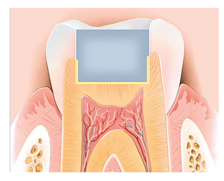
Ionosit Baseliner seals the dentin tubules and thus prevents postoperative sensitivity.

Ionosit Baseliner serves as a stress-breaker for the entire cavity as it counteracts the polymerization shrinkage of the restoration. Structural stress or microfractures in the composite are minimized. This guarantees durable, functionally reliable restorations.