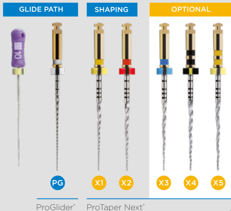
ProGlider® ProTaper Next®